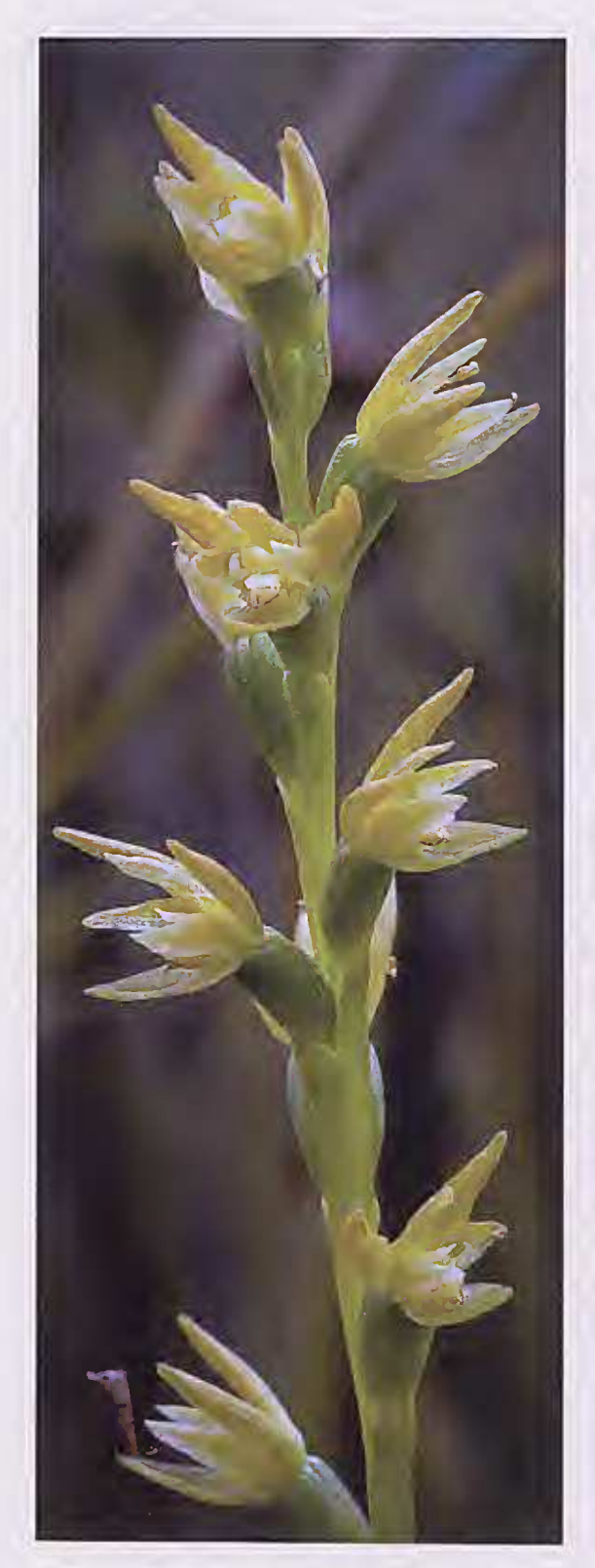
Figure 1. Prasophyllum abblittiorum